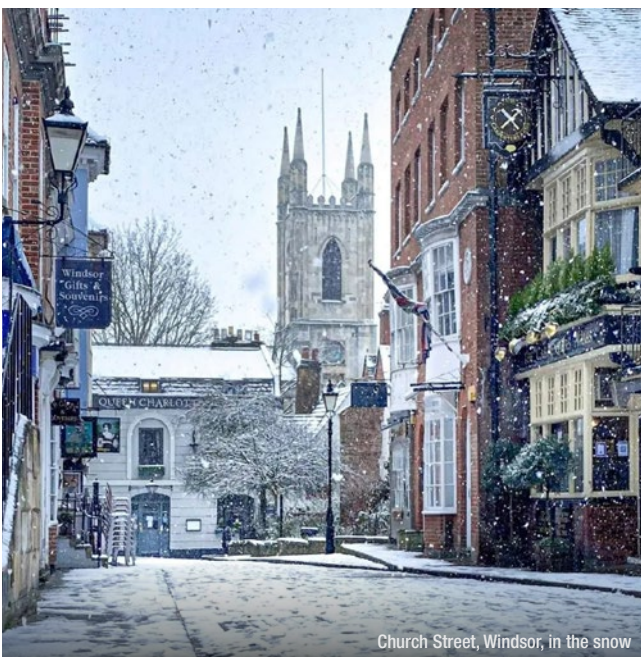
Church Street, Windsor, in the snow