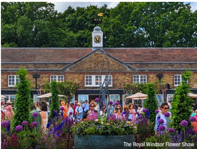
The Royal Windsor Flower Show