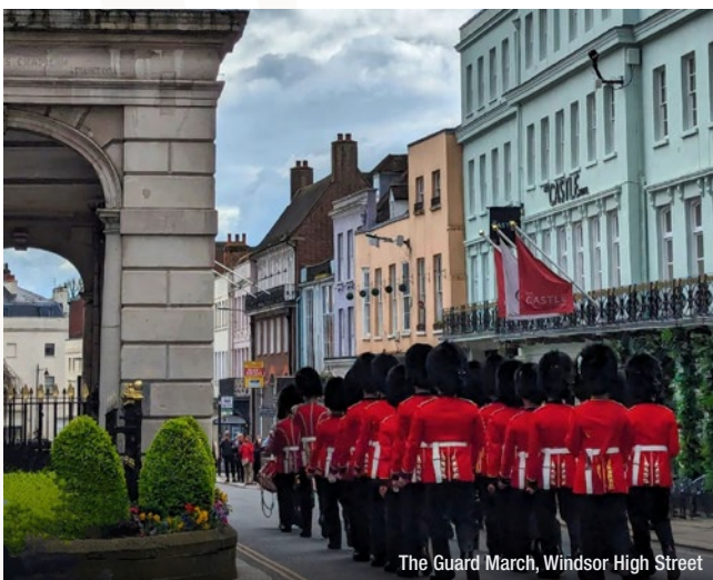
The Guard March, Windsor High Street