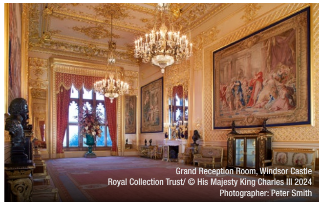
Grand Reception Room, Windsor Castle

At Escape in 60 three themed 60-minute challenges can be tailored to your group – up to 24 per hour. They are highly interactive and involve: problem solving; instinct; logic; communication; patience; thinking out loud; creativity and above all, teamwork.