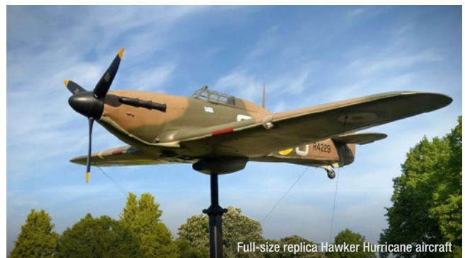
Full-size replica Hawker Hurricane aircraft