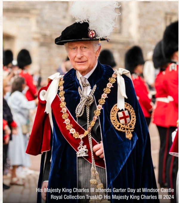
His Majesty King Charles III attends Garter Day at Windsor Castle

More trade and groups information is available on the Royal Collection Trust website .