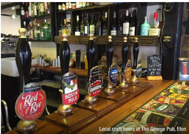
Local craft beers at The George Pub, Eton

Great Fosters recently switched to 100% renewable electricity supply, mainly derived from offshore wind-power farms. The Runnymede Hotel successfully diverts 100% of waste from landfill sites and uses an Eco-Safe Digester to aerobically digest all food waste. There's an underground energy centre at Coworth Park , which is the UK's only hotel to grow its own fuel by cultivating willow on the estate for use in the biomass heating plant.