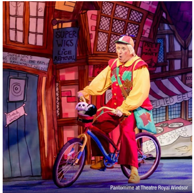
Pantomime at Theatre Royal Windsor

There's always a fabulous line-up of events, Christmas lights switch-ons, Christmas Fayres and Festive Markets. Allow time for shopping for unique gifts and gorgeous decorations. Experience Windsor Castle decked with twinkling lights, garlands and shimmering Christmas trees. Book a Christmas lunch, dinner or even a party!