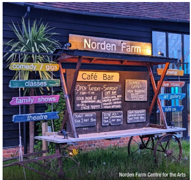
Norden Farm Centre for the Arts

Waltham Place in White Waltham is a 220-acre organic and biodynamic farm of which 50 acres is woodland, a lake, ornamental and kitchen gardens. It offers a wide range of garden tours, and you can book a private group tour on Wednesdays and Fridays.