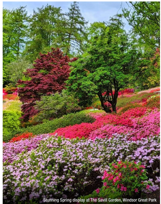
Stunning Spring display at The Savill Garden, Windsor Great Park