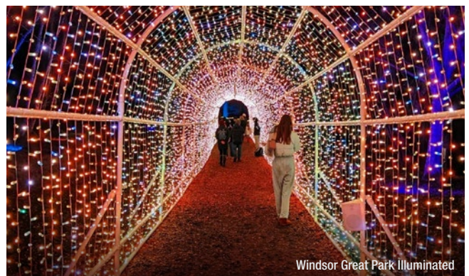
Windsor Great Park Illuminated

To see everything that is going on in the Royal Borough at Christmas please visit the destination website .