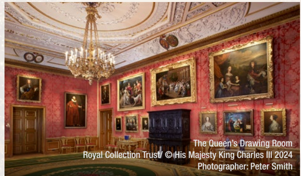
The Queen's Drawing Room