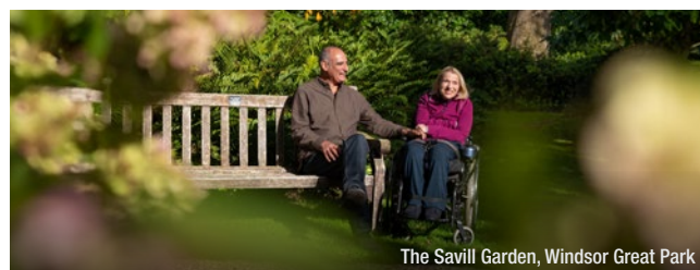
The Savill Garden, Windsor Great Park