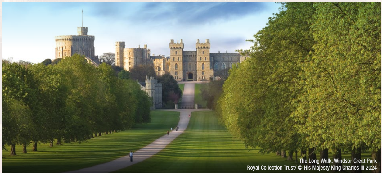
The Long Walk, Windsor Great Park