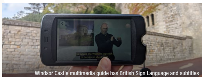
Windsor Castle multimedia guide has British Sign Language and subtitles

For more details on accessibility within the Royal Borough, please visit the destination website .