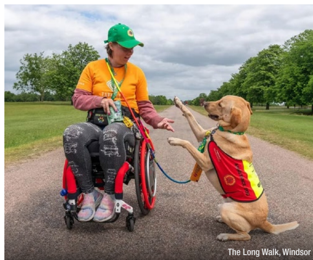
The Long Walk, Windsor

For detailed access information, please visit the Royal Collection Trust website .